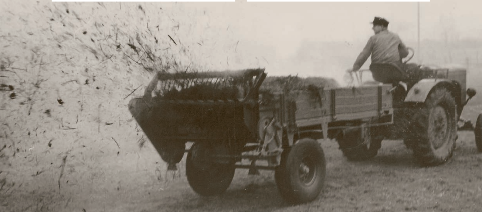
Fortuna Special in use (1954)